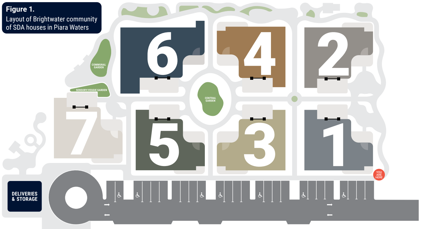
Figure 1. Layout of Brightwater community of SDA houses in Piara Waters

The houses are all connected by a large sensory garden space with different “rooms” to support a variety of outdoor experiences for the clients and to encourage families, staff, visitors and volunteers to spend time using the spaces both for their own enjoyment but also as part of an opportunity to interact with the clients. The garden “rooms” will include spaces for sitting in quiet contemplation, spaces for active involvement, such as the kitchen garden and spaces that create mobility challenges for both clients and potentially any visiting children.